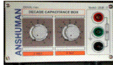
2 Decade Capacitance Box Model : DCB - 2